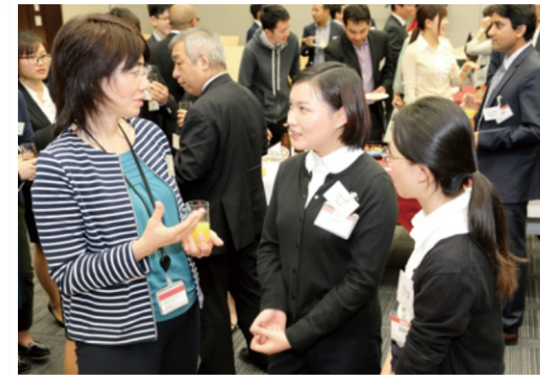
Snapshot of the annual reception

In addition to the scholarship itself, each year MC provides an opportunity for the recipients to visit the Kyu-Iwasaki-tei Gardens, attend a group gathering with fellow scholarship recipients and a reception with MC employees. Through these efforts MC provides the students with various opportunities to develop their career and deepen their understanding of Japan.