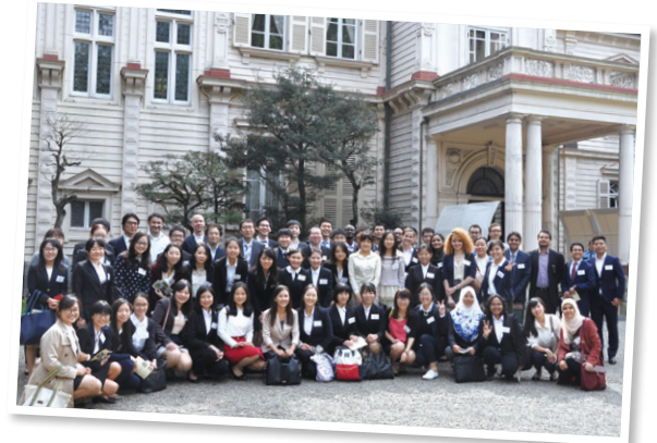
Snapshot of scholarship students visiting Kyu-Iwasaki-tei Gardens (2016)

MC has been offering this scholarship program since 1991 with the aim of assisting international students who are studying at Japanese universities and are expected to become future global leaders. In 2007, MC began to expand the scope of the program to cover approximately 100 students each year. As of the year ending March 2017, a total of 1,207 students have been awarded these scholarships.