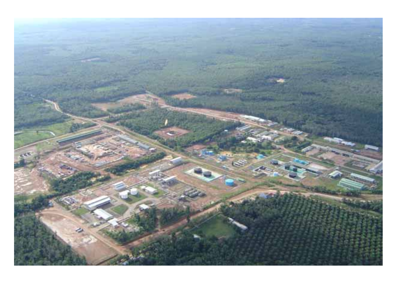
Medco's Rimau Block in the Middle Area of Sumatra Indonesia