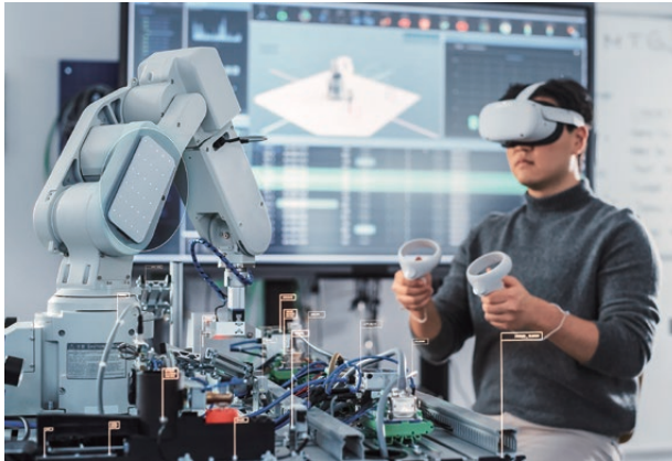
This image is for illustration purposes only.

This scholarship was established in 2021 as a scholarship awarded by the Japan Educational Exchanges and Services (JEES) for graduate students (taking doctoral courses) in Japan, a demographic which MC has traditionally not provided assistance to.