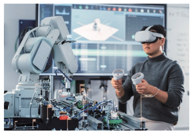
This image is for illustration purposes only.

This scholarship was established in 2021 as a scholarship awarded by the Japan Educational Exchanges and Services (JEES) for graduate students (taking doctoral courses) in Japan, a demographic which MC has traditionally not provided assistance to.