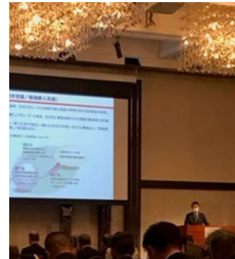
Photo taken in the regional business matching event