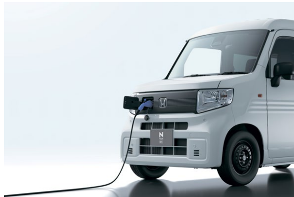
Honda's new commercial-use mini-EV, Honda N-VAN e:

URL : https://on.honda.co.jp/nvan-e (Japanese)