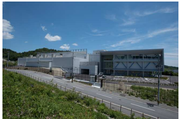
Osaka Saito DC external view 2