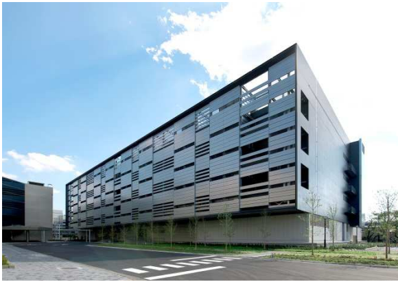
Mitaka DC external view