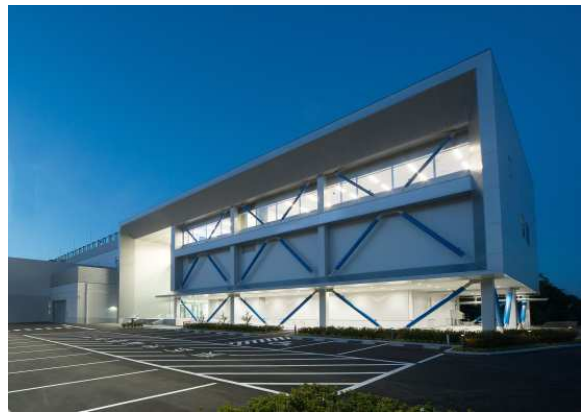
Osaka Saito DC external view 1